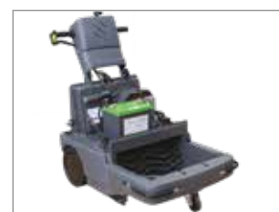
EASY MAINTENANCE TRAY