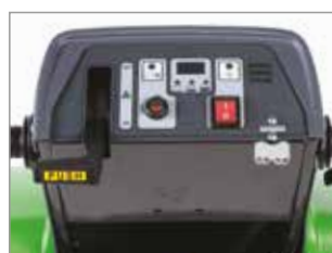
INTUITIVE CONTROL PANEL